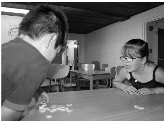
Reading University students practiced their literacy skills by playing various word games.

Thirty-five students between the ages of 7 and 10 years, all in grades 2 and 3, took part in the first-ever Reading University in July, with a goal of improving their reading and comprehension skills. The program was developed based on the belief that students who do not read at grade level by the end of grade three struggle to succeed in learning as they get older. The hope was that students, under the direction of eight enthusiastic young staff members, would have so much fun at Reading University that they'd forget they were also learning.